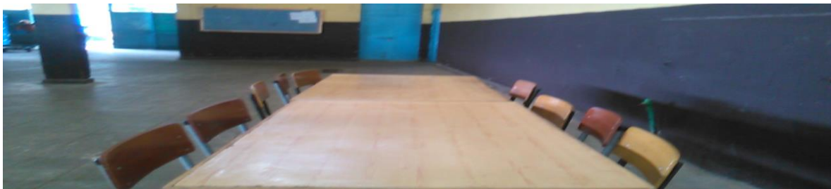
Feeding room for students with disabilities