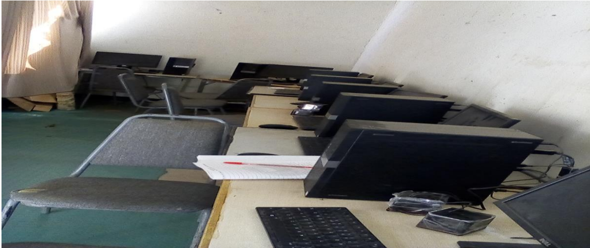
Internet room for students with special need at Wollo University

This kind of service were not common to all sampled universities. In the same vine, one university had assistive computer technology with JAWs software for students with visual impairment in one branch of the library (Wollo University). In addition, the department of special needs education set up resource center which has assistive computer technology with the above software (Gondar University). This resource center has been providing training and internet service for all students with disabilities found in the university. Two universities also established disability service center for the purpose of assisting students with disabilities found in all departments (Wollo and Debre Tabor University.)